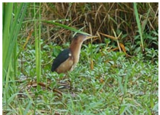
Least Bittern at Bagua

3 seen near Santa Rosa and 2 seen at Tinajones reservoir