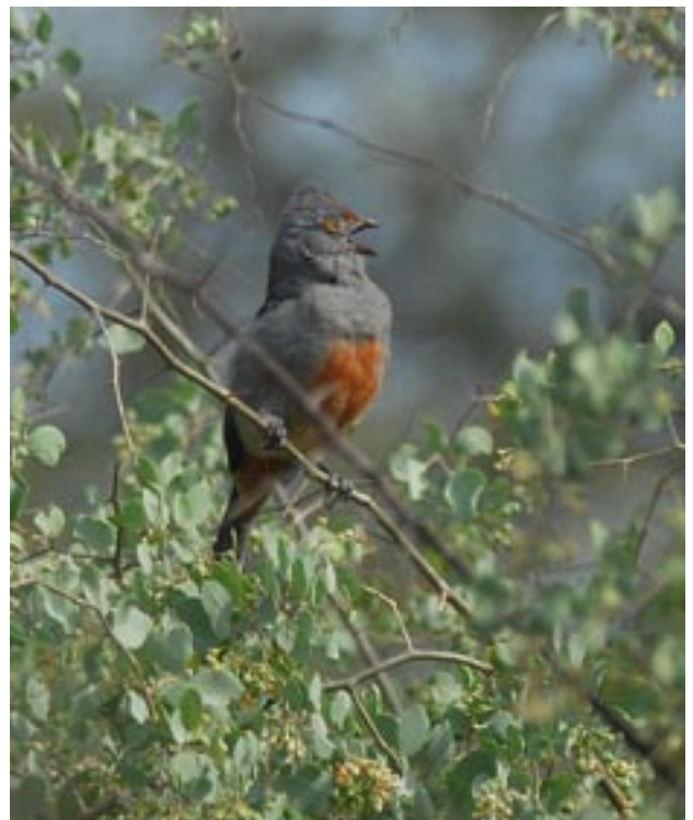
Male Peruvian Plantcutter