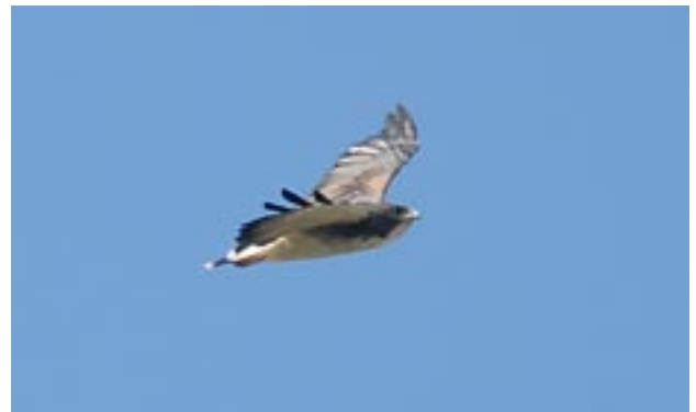
Adult pale morph White-tailed Hawk

3 seen between Cajamarca and Celendin and 1 at Abra Barro Negro