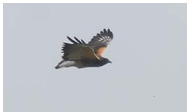
Adult dark morph White-tailed Hawk